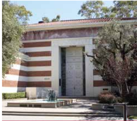
6 Harris Hall