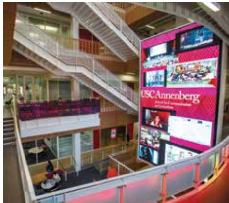
14 Wallis Annenberg Hall