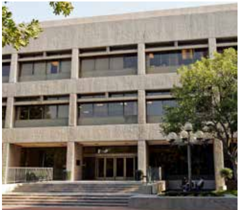
4 Musick Law Building