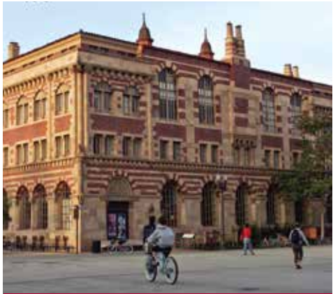
2 Student Union Building