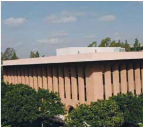
10 Ethel Percy Andrus Gerontology Center