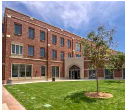
8 Irvine and Young Hall