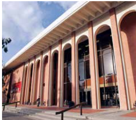
13 Grace Ford Salvatori Hall