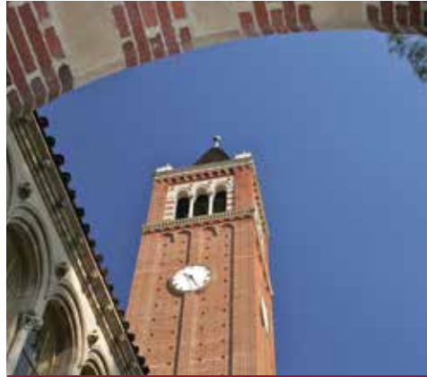
5 Mudd Hall