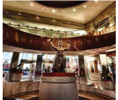
17 Heritage Hall