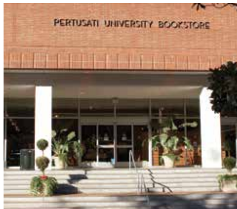
15 USC Bookstore