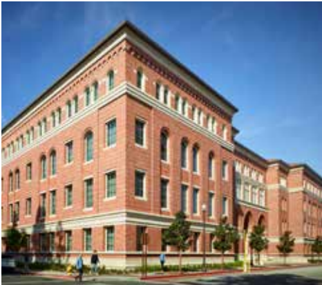
11 Michelson Center for Convergent Bioscience