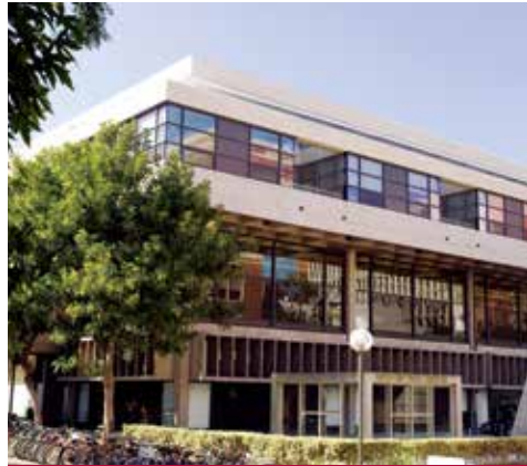
7 Watt Hall