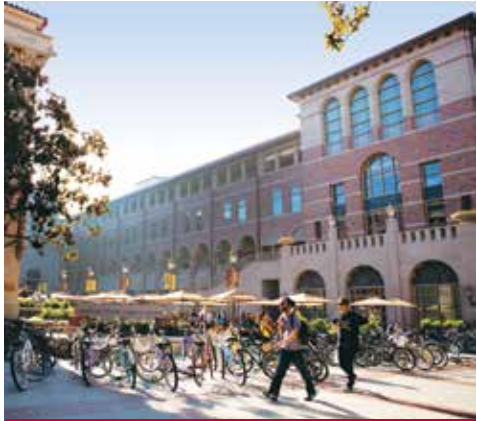
1 Ronald Tutor Campus Center