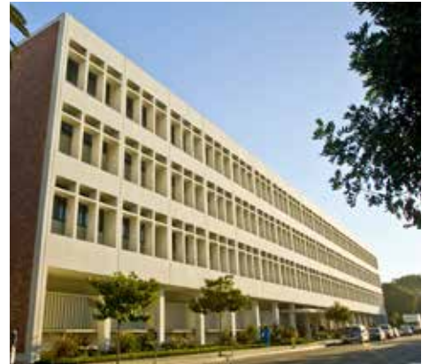
19 The Norris Dental Science Center