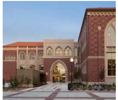
20 Kaufman International Dance Center