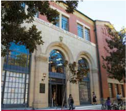
3 Leventhal School of Accounting