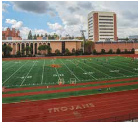
16 Katherine B. Loker Track Stadium/Allyson Felix Field