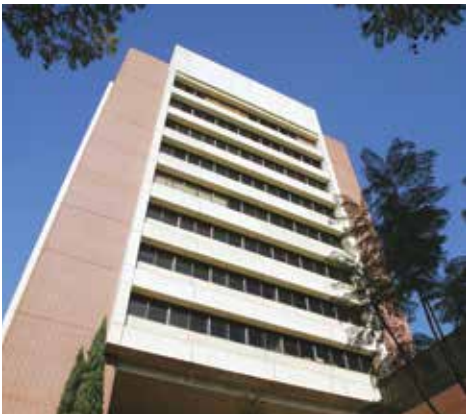
12 Seeley G. Mudd Building