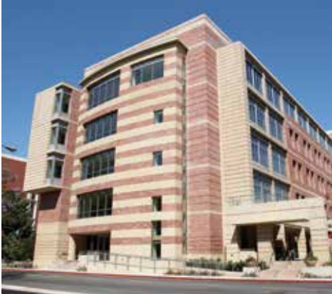
9 Ronald Tutor Hall