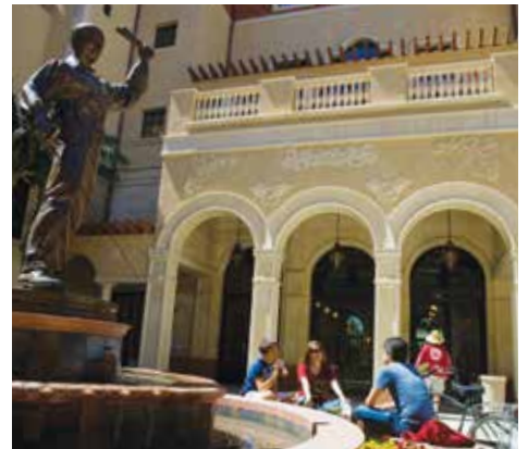
18 USC School of Cinematic Arts